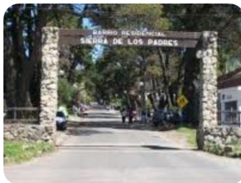
Sierra de los Padres main entrance

Lighthouse: It is a very old lighthouse. People made it in 1891 and it is part of Marplatense heritage. It has several long flights of stairs, each one has 154 steps. That lighthouse is found in the south of the city; next to de aquarium and the most expensive beaches.