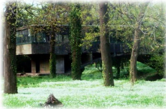
The school is next to a very important and old building of the city known as the House over the Brook .

Getting into the school premises, the entrance hall leads into the stairs to the 1 st floor and the doors that take to the park. To the right, it can be seen the tutor room. On the left, it can be seen a corridor that takes to the classrooms, the laboratory, the bathrooms and another tutor room. Then, that corridor turns to the right and there are more classrooms, two music rooms, another stairs that leads to the 1 st floor, a third tutor room. The corridor turns to the right again, and reaches the buffet. Now continues the corridor to the photocopier; to the left, there are the CENI room, another bathrooms, the parents club, the artistic room; and there are a stairs that takes you to the library. To the right there are another door, that takes you to the park.