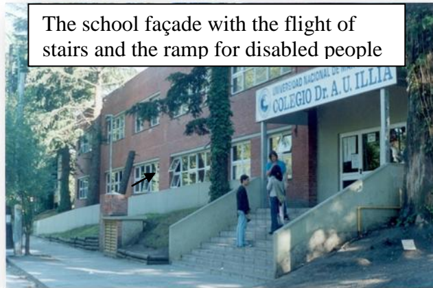
The school façade with the flight of stairs and the ramp for disabled people

Getting into the school premises, the entrance hall leads into the stairs to the 1 st floor and the doors that take to the park. To the right, it can be seen the tutor room. On the left, it can be seen a corridor that takes to the classrooms, the laboratory, the bathrooms and another tutor room. Then, that corridor turns to the right and there are more classrooms, two music rooms, another stairs that leads to the 1 st floor, a third tutor room. The corridor turns to the right again, and reaches the buffet. Now continues the corridor to the photocopier; to the left, there are the CENI room, another bathrooms, the parents club, the artistic room; and there are a stairs that takes you to the library. To the right there are another door, that takes you to the park.