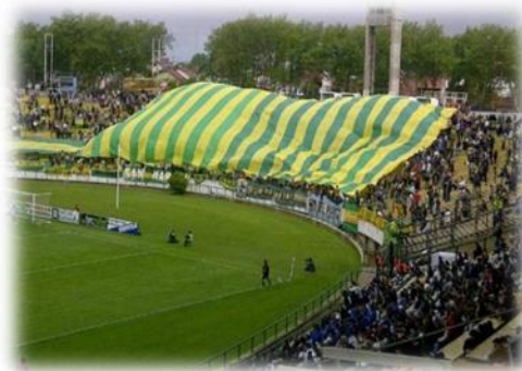
Aldosivi’s fans in the stadium José María Minella, in Mar del Plata