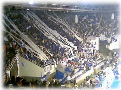
Peñarol supporters in the stadium Malvinas Argentina, in Mar del Plata

Mar del Plata is a very big city located in the province of Buenos Aires. Year after year a lot of people come to the city to spend their holidays, especially in summer. In this part of the year, there are a lots of tournaments related to different sports. The most important is the soccer tournament named differently according to the times. However, Basketball is a sport whose popularity is growing thanks to events like “la Liga de las Estrellas” (Stars’ League) which is held in summer. This sport has become very important because it has lots of followers and there are some outstanding clubs like Peñarol.